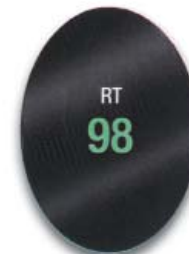
(1.25X Actual size)